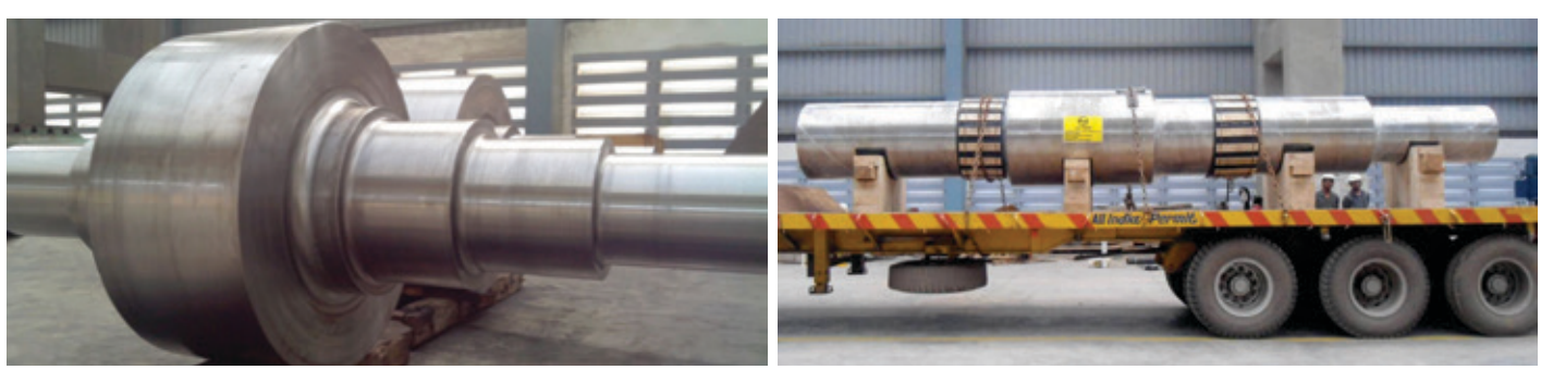
Our cement & mining industry range includes forged shafts for crushers and mills.

L&T Special Steels and Heavy Forgings provides customers with the widest range of finished forgings. We provide solutions for customised, end-to-end requirements, from steel-making to forging. We provide the widest range of high grade steels, with applications as varied as industrial piping and aerospace. We offer customers a perfect blend of size, variety, accelerated delivery and quality.