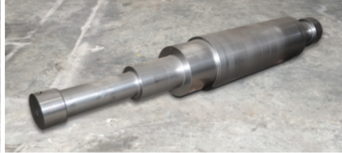
Our power equipment range includes generator shafts, rotors and turbine shafts.