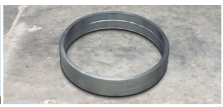
Our defense equipment range includes plates, gun barrels and shells & rings.