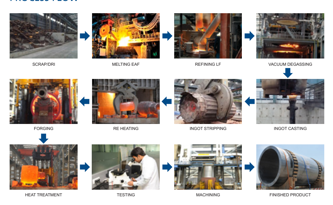
Scrap to finished forging