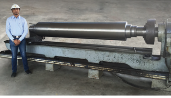
Our steel industry range includes steel mill rolls, mould I die steels, Blow Off Preventer (BOP).