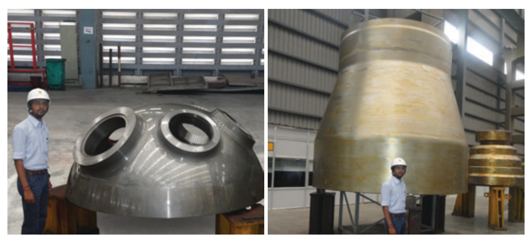
Our nuclear product range includes shells, dished ends, cones and tube-sheets.